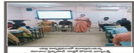
సంస్కృత-వ్యక్తిత్వ వికాసంపై చర్చా కార్యక్రమంలో పాల్గొన్నవారు.

విజయవాడ, మార్చి 1 (ఆంధ్రప్రభ) : సంస్కృత-వ్యక్తిత్వ వికాసంపై చర్చా కార్యక్రమం, శ్రీరామ కళాశాల, రాజ్ గంగుల నెహ్రు యువ కేంద్రం, విజయవాడలో జరిగింది. ఈ సందర్భంగా సంస్కృత-వ్యక్తిత్వ వికాసంపై చర్చా కార్యక్రమం, శ్రీరామ కళాశాల, రాజ్ గంగుల నెహ్రు యువ కేంద్రం, విజయవాడలో జరిగింది.